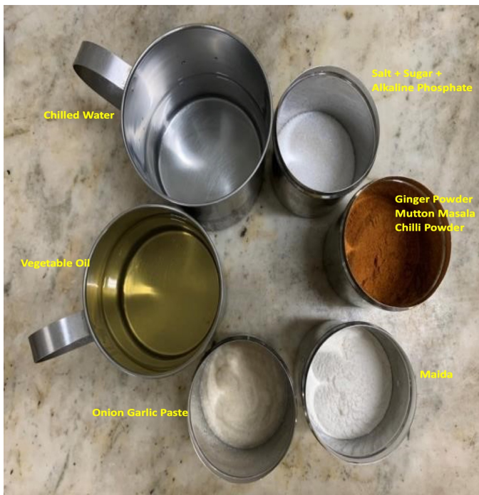
Fig. 1 Ingredients required for preparation of meat batter

soluble proteins. Vegetable oil was added while the bowl chopper was running slowly and then mixed thoroughly at high speed for 30 seconds to get a meat emulsion. Further green condiments, refined wheat flour, and dry spices mix were